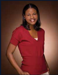
Knowledge Operations Management

“Serving part-time in the Air Guard has made it possible for me to pursue my career, with plenty of time left to spend with my family. Even working full-time, I’m able to enjoy my hobbies and interests —swimming, camping, whitewater rafting, and running for charity.”